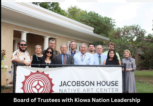
Board of Trustees with Kiowa Nation Leadership