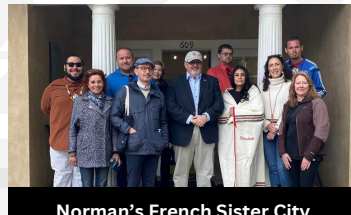
Norman's French Sister City Delegation