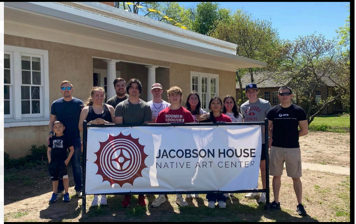
OU's American Indian Science and Engineering Society