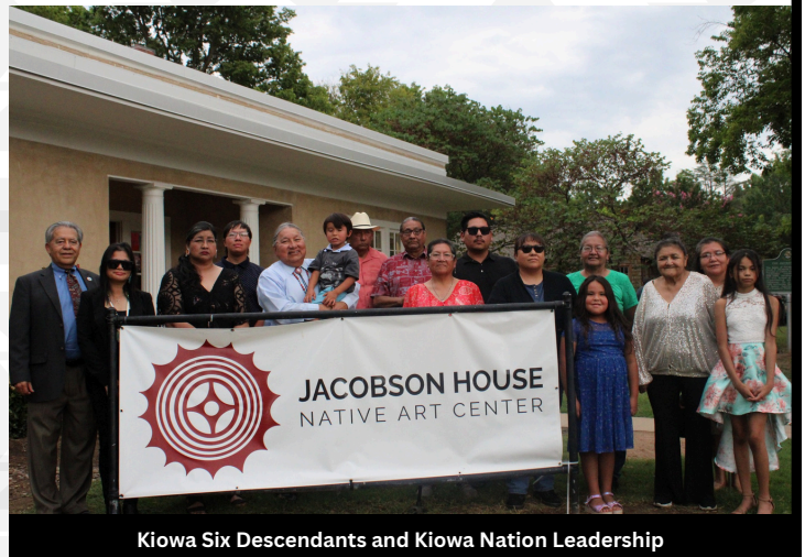
Kiowa Six Descendants and Kiowa Nation Leadership