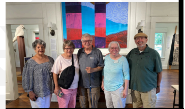
Gilcrease Museum Docents